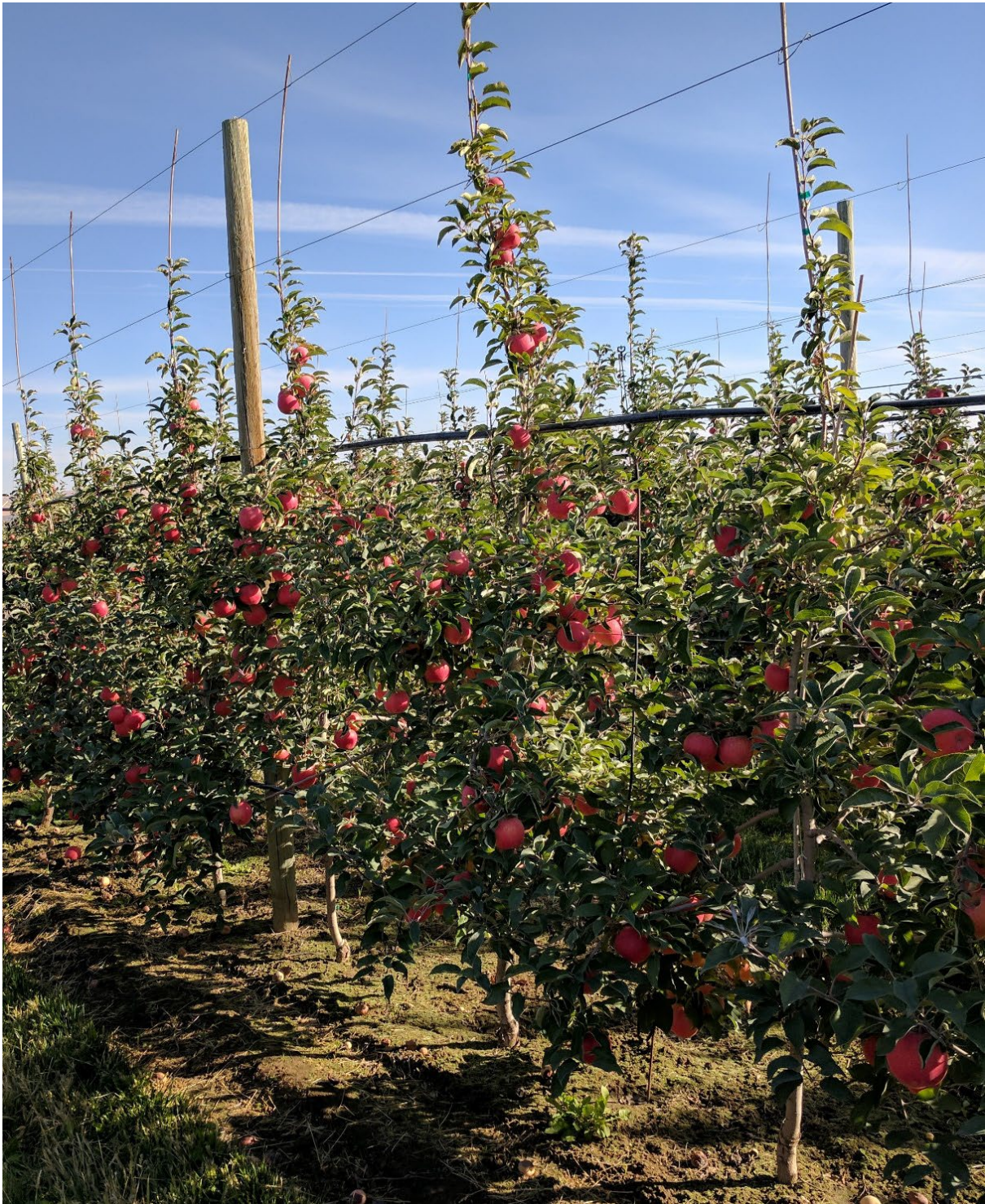
Figure 1. WA 64 trees 3 rd leaf on G.41 rootstock